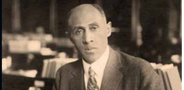
California Assemblyman Frederick Madison Roberts pictured at his desk in the California Assembly. As California's first elected black state Assemblyman, Roberts worked with Black Republican race leaders and his fellow legislators to champion a number of important legislative measures. Roberts sponsored California's early civil rights legislation, and also authored legislation that established UCLA.