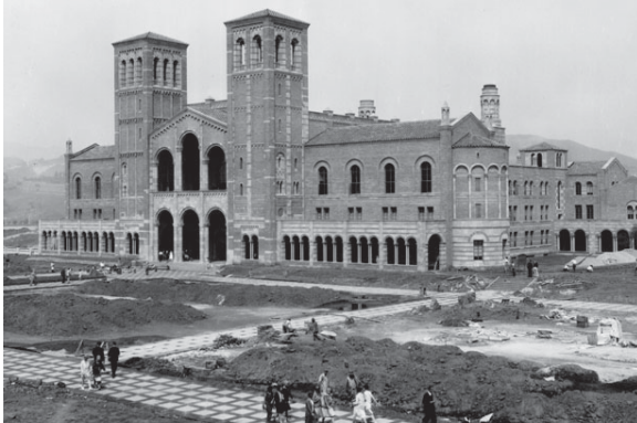
Opening Day on the new UCLA Westwood campus, September 20, 1929. Construction activity continued while classes began.