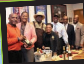
Senator Rod Wright and Assemblyman Isadore Hall, III co-hosted a reception open to the Capitol community in support of and featuring wines provided by the Association of African American Vintners (AAAV).

Fifth Annual Fall Leadership Symposium and Business Roundtable October 2013