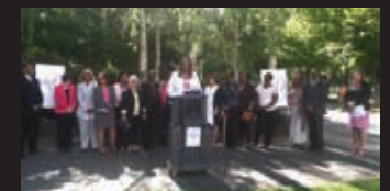
Addressing the health disparities among African American women, the CLBC partnered with Susan G. Komen to educate and inform African American communities about breast cancer.