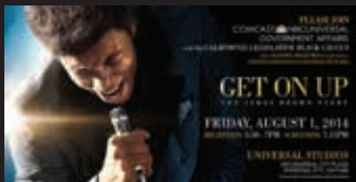
Celebrating the contribution of African Americans to the fields of arts and entertainment, the CLBC hosted a screening of the James Brown biopic Get on Up.