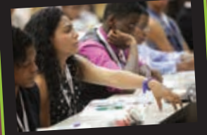
Students participating in the 2013 AALT leadership training and college readiness program during an intensive three-and-a-half-day seminar that engaged more than 50 high school students in hands-on activities, thought-provoking discussions with senior business professionals and noted academic leaders on the campus of CSU Dominguez Hills.

Reception Celebrating California's Black Vintners February 2013