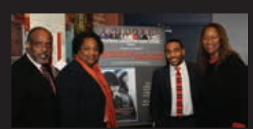
In support of our 2020 Initiative and our goal of increasing dialogue around creating educational opportunities for African American students, CLBC members sponsored a screening and discussion of American Promise.