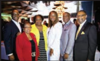
CLBC members celebrate CA Scholars