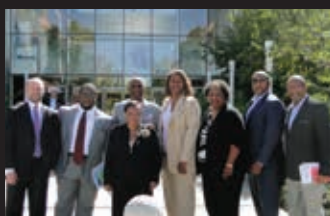
CLBC members and the Silicon Valley Foundation held a hearing regarding African American students and educational disparities.

CLBCPI Summer SOULstice CA Scholars Reception June 2014