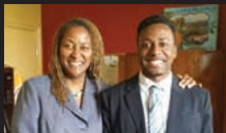
Announcement of the 2014 CA Scholars recipients. Each scholar received $2,500 and a laptop computer donated by HP.