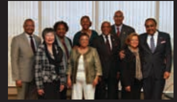
In recognition of Black History Month, the CLBC honored activist and author Dr. Clarence Jones along with eight other California civil rights luminaries.

CLBC Hosts Elected Officials and Business Executives Delegation from Angola, Mozambique, Cape Verdes and Portugal June 2014