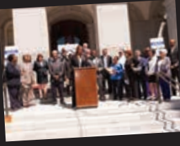
Honoring the life and legacy of Dr. Martin Luther King Jr. during a Senate and Assembly Floor session; and, a pictorial exhibit of the King monument in honor of the 50th Anniversary of the March on Washington.